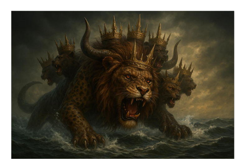
Daniel 7:25: "And he shall speak great words against the most High, and shall wear out the saints of the most High, and think to change times and laws : and they shall be given into his hand until a time and times and the dividing of time."

Revelation 13:1-3: And I stood upon the sand of the sea, and saw a beast rise up out of the sea, having seven heads and ten horns, and upon his horns ten crowns, and upon his heads the name of blasphemy. And the beast which I saw was like unto a leopard, and his feet were as [the feet] of a bear, and his mouth as the mouth of a lion: and the dragon gave him his power, and his seat, and great authority. And I saw one of his heads as it were wounded to death; and his deadly wound was healed: and all the world wondered after the beast."